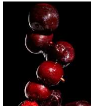
Kea plums